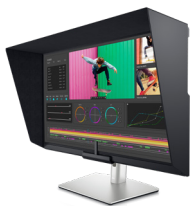
Dell UltraSharp 32 HDR PremierColor Monitor - UP3221Q

Create phenomenal 4K HDR content on the world's first professional monitor with 2K mini-LED direct backlit dimming zones.*