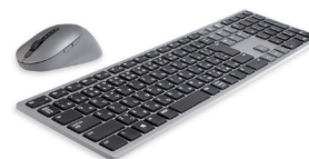
Dell Premier Multi-Device Wireless Keyboard and Mouse - KM7321W

Elevate your productivity on this innovative 27-inch QHD Hub monitor with a wide color coverage including DCI-P3. Features ComfortView Plus an always-on built-in low blue light screen, USB-C with up to 90W power delivery, and RJ45 connectivity.