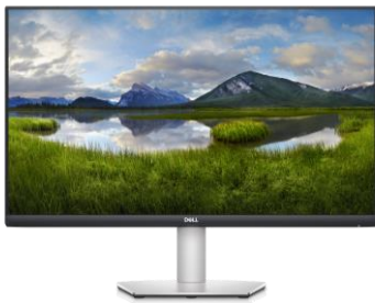
Dell 27 4K UHD Monitor - (U2720QS)