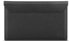
Dell Premier Sleeve - XPS 17