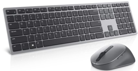
Dell Premier Multi-Device Wireless Keyboard and Mouse (KM7321W)