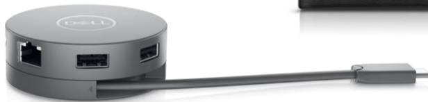
Dell USB-C Mobile Adapter - DA310