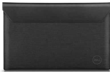
Dell Premier Sleeve - PE1320V