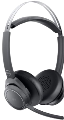
Premier Wireless ANC Headset - WL7022