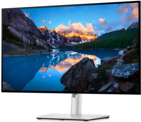
Dell UltraSharp 27 USB-C HUB Monitor - U2722DE