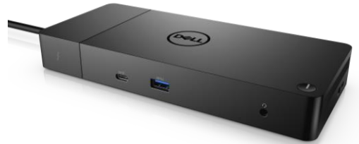
Dell Thunderbolt Dock - WD19TB