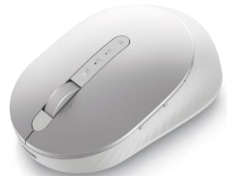
Dell Premier Rechargeable Wireless Mouse - MS7421W