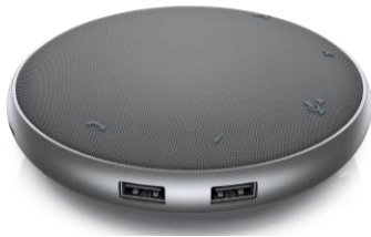
Dell Mobile Adapter Speakerphone - MH3021P