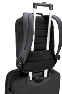
Dell Premier Slim Backpack 14