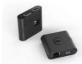
Dell Adapter DA200 – USB-C to HDMI/VGA/Ethernet/USB 3.1 Gen 1