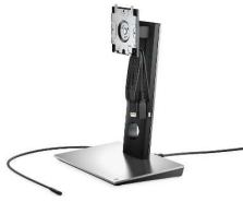
Dell Dock with Monitor Stand - DS1000