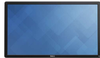
Dell UltraSharp 24 InfinityEdge Monitor – U2417H WOST