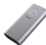
Dell Portable Thunderbolt™ 3 SSD, 500GB (SD1-T0500)(M)