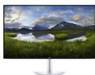
Dell 27 USB-C Ultrathin Monitor - S2719DC