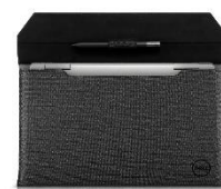
Dell Premier Sleeve - XPS 17